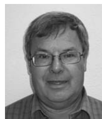
Under 100 Art Foeste