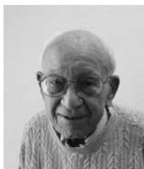
Under 1500 Al Nadel